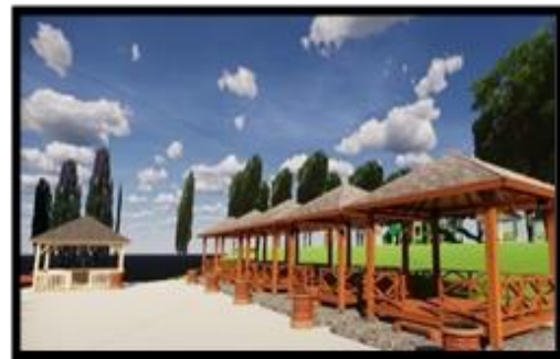
Figure 3 Gazebo Design and Swimming Equipment Rental Site

The Gazebo near the pond was added because usually not all visitors come to Sumber Jenon to swim but some come just to enjoy the natural atmosphere in Sumber Jenon. So added a Gazebo on the right side and lounge chairs around the pond. In addition, at the end of the left side there is a rental place for swimming equipment such as tires, buoys and diving equipment, as shown in Figure 3.