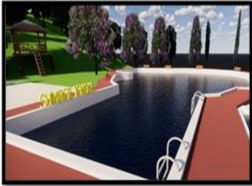
Figure 5 Public Bathroom Design