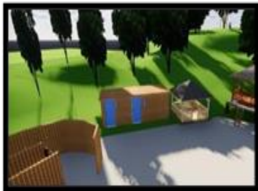
Figure 6 Spring Water Pond Design

In this Jenon source pond there is no changes in shape, but there are only additional attributes such as a handle on the pond and garden chairs, as shown in Figure 6. The addition of this attribute is intended to make it easier for visitors who are in the pond, or those who are just lounging on the edge of the pond.