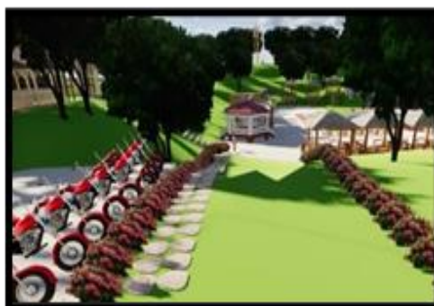
Figure 2 Entry Gate Design of Sumber Jenon

Sumber Jenon does have an entrance, so it is necessary to add some flower plants along the path to the pond, as shown in Figure 2. Because the road from the ticket booth to the pond is rather steep, so that the right side of the stairs is added to make it easier for visitors, but the left side is not changed due to anticipation of visitors bringing baby strollers.