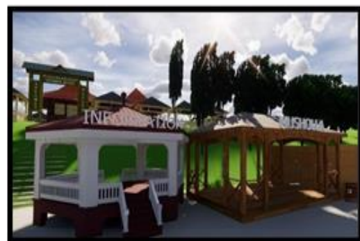
Figure 4 Information Center Design and Mushola

Information Center which already available and comes with the prayer room. But the thing that must get an attention is the positioning so that it will be easier to access by visitor who have already been in souvenir store or near the pond. The place for ablution is made of bamboo and separate for men and women, as shown in Figure 4.