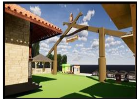
Figure 8 Design Exit Gate Jenon Spring Water Area

The exit gate from the souvenir store is made directly into the parking lot to make it easier for visitors. In addition, seeing the existing condition of the parking lot at Sumber Jenon which is quite wide, it can accommodate quite a number of two-wheeled vehicles and four-wheeled vehicles, as shown in Figure 8.