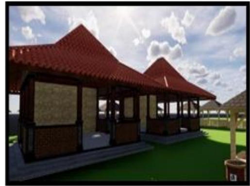
Figure 7 Souvenir Store Design