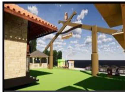
Figure 8 Design Exit Gate Jenon Spring Water Area

The exit gate from the souvenir store is made directly into the parking lot to make it easier for visitors. In addition, seeing the existing condition of the parking lot at Sumber Jenon which is quite wide, it can accommodate quite a number of two-wheeled vehicles and four-wheeled vehicles, as shown in Figure 8.