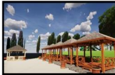
Figure 3 Gazebo Design and Swimming Equipment Rental Site

The Gazebo near the pond was added because usually not all visitors come to Sumber Jenon to swim but some come just to enjoy the natural atmosphere in Sumber Jenon. So added a Gazebo on the right side and lounge chairs around the pond. In addition, at the end of the left side there is a rental place for swimming equipment such as tires, buoys and diving equipment, as shown in Figure 3.