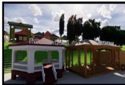
Figure 4 Information Center Design and Mushola

Information Center which already available and comes with the prayer room. But the thing that must get an attention is the positioning so that it will be easier to access by visitor who have already been in souvenir store or near the pond. The place for ablution is made of bamboo and separate for men and women, as shown in Figure 4.