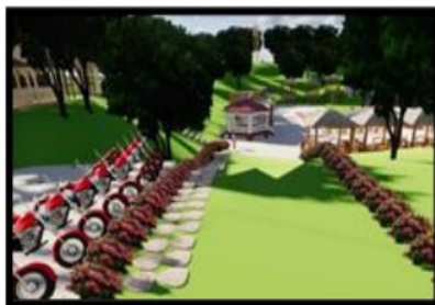
Figure 2 Entry Gate Design of Sumber Jenon

Sumber Jenon does have an entrance, so it is necessary to add some flower plants along the path to the pond, as shown in Figure 2. Because the road from the ticket booth to the pond is rather steep, so that the right side of the stairs is added to make it easier for visitors, but the left side is not changed due to anticipation of visitors bringing baby strollers.