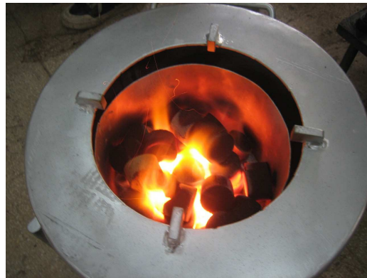
Figure 3. Photograph of MSW briquette fire