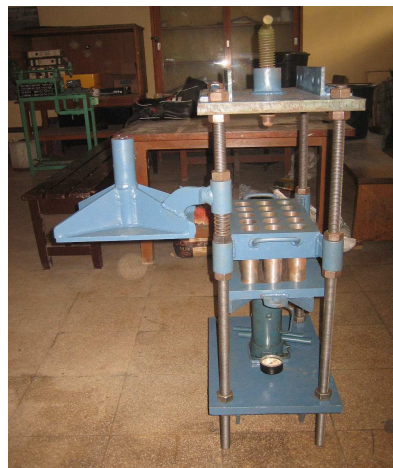
Figure 1. Photograph of presser