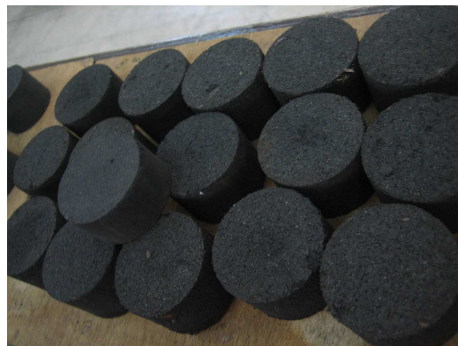
Figure 2. Photograph of MSW briquettes