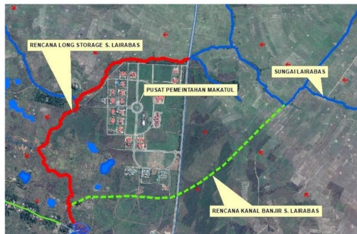
Figure 2. Canal and Long Storage Plans of Lairabas River

of the blast, and is redirected back to the Lairabas river channel downstream. The flood channel is planned to have a rectangular area with a length of 2405 m, a base width of 8 m, and a depth of 3 m. Long storage is made by deepening and widening the Lairabas river line next to the office center area, aiming to control the elevation of the water surface so as not to generate back water in the tributaries that drain water from the office center area. Long storage is planned to be rectangular with dimensions: length 3240 m, base width 15 m, and depth of 3 m.