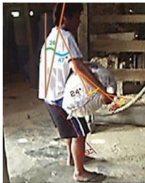
(a) Stage 1

Characteristics of respondents in Rice Milling in Malang, East Java.