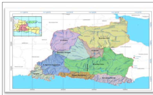
Figure 3: Brantas River Region Boundaries

Profile of Brantas river region is explained as follows. Its catchment area is 14,103 km 2 . River length is \pm 320 km that crosses 16 regencies/cities. Average rainfall has reached 2,000 mm/year with 85% falling during rain season. Surface water potential per year, in average, is 13.232 millions m 3 , and it has been utilized for 5-6 millions m 3 /year. Brantas river region development has been started in 1961 with the better planned, integrated, comprehensive, and sustainable approaches that are also environmental friendly, supported with integrated management system. It is empowered by tenet that River Region is a hydrologic unity (one river, one plan, and one integrated management).