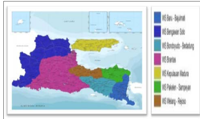
Figure 2: River Region Division in East Java Province

27 regions across-provinces, 37 national strategies, 51 regions across regencies/cities, and 13 regions in one regency/city. The determination is adjusted to the discretion of each region. One of national strategic river region is Brantas river region (Figure 2 and 3). Brantas river region represents the second biggest river region in East Java and has occupied \pm 25\% of East Java Province spread.