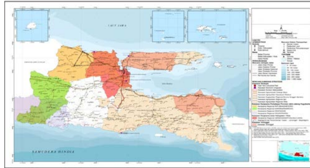
Figure 1: Strategic Region Boundaries

Space restructuring for strategic region is a region where space restructuring is given higher priority because it has very important effect on sovereignty, security and defense, economic, social, culture and/or environment, including the region labeled as world legacy. Pursuant to Article 26 in Law 26/2007 on Space Restructuring, one of substances that must be planned under RTRW is the determination of strategic region with the scopes of national, province and regency/city levels [7]. Based on Article 6 in Law 26/2007, space restructuring is performed by giving attention to several targets such as: 1. Physical condition of the regions throughout Unitary State of Indonesia Republic that are vulnerable to disaster; 2. Potentials of natural resource, human resource and man-made resource; economic condition, social, culture, politic, law, security and defense, life environment, and knowledge and technology as one unity; and 3. Geo-strategy, geo-politic and geo-economic issues.