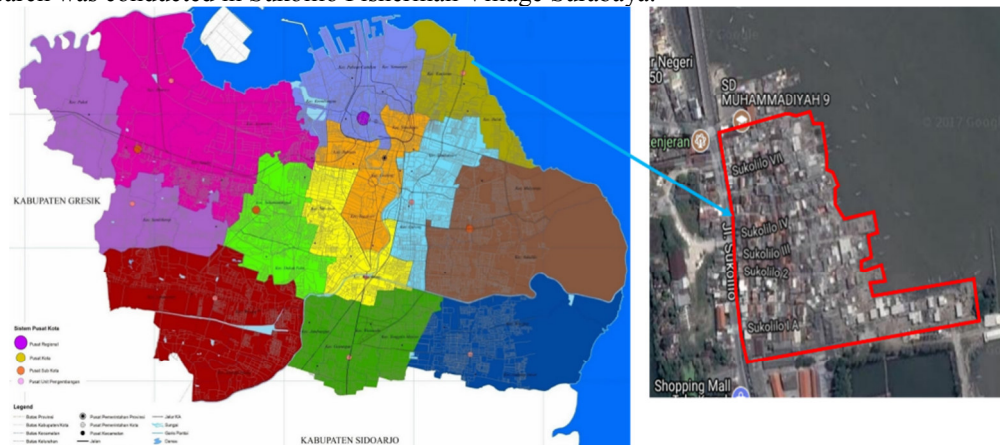
Figure 1. Sukolilo Fisherman Village, Bulak Sub-district, Surabaya

This research was conducted in Sukolilo Fisherman Village Surabaya.