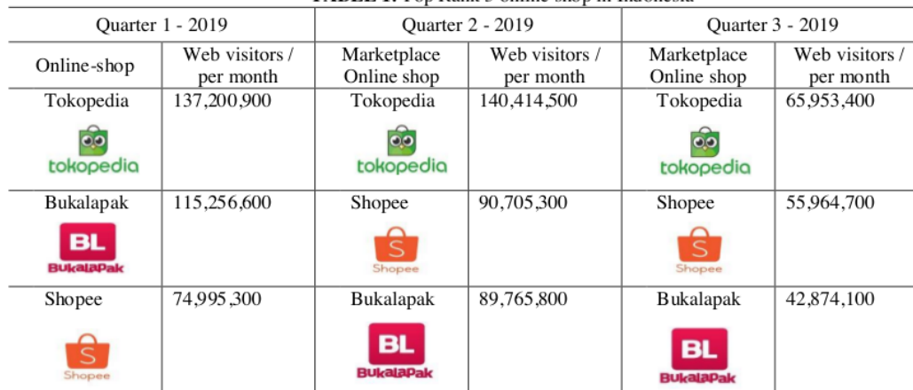
TABLE 1. Top Rank 3 online shop in Indonesia

Sumber : https://iprice.co.id/insight.co