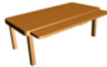
Figure 6. Model E design.

The figure shows the design of laptop table with a place for food and drink that can be pulled forward. It has brown color and is made of wood. It was chosen by 8 respondents.