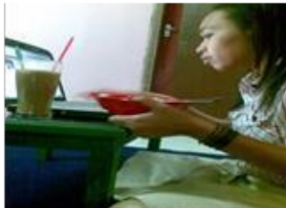
Figure 1. Table at a cafe with hotspot.

In the past, cafes were only used as a place to drink coffee or enjoy food in a relaxed atmosphere. Along with the development of the era, cafes also adjust themselves by providing internet facilities which is commonly called a hotspot area. We often find tables at lesehan cafes with hotspot area that are not ergonomic to put food, drink and laptop. This is the same as table that does not have a special place to put a laptop, drink or food that makes it rather difficult for the users to put food/drink as seen in figure 1.