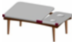
Figure 3. Model B design.

The design of the laptop desk is equipped with a place for food and drink and a space for laptop that can be adjusted. The color is white and it is made from wood. 8 respondents chose this design.