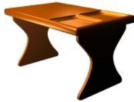
Figure 2. Model a design.

The design of a laptop desk is equipped with a place for food and drink. The color of the laptop desk is brown and it is made from wood. This design was chosen by 15 respondents.