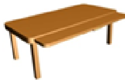
Figure 6. Model E design.

The figure shows the design of laptop table with a place for food and drink that can be pulled forward. It has brown color and is made of wood. It was chosen by 8 respondents.