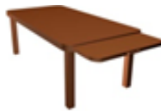
Figure 5. Model design D.

Here is the design of a laptop table with a place for food and drink that can be pulled sideways. The color is brown and is made of wood. 9 respondents chose this design.