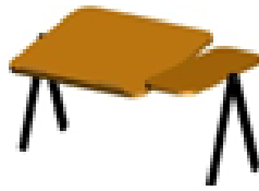
Figure 4. Model C design

This laptop table is designed with a space for laptop that can be adjusted. It has brown color and is made of wood. It was chosen by 10 respondents.