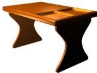
Figure 2. Model a design.

The design of a laptop desk is equipped with a place for food and drink. The color of the laptop desk is brown and it is made from wood. This design was chosen by 15 respondents.