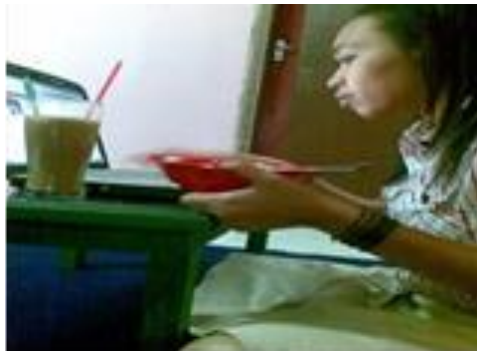
Figure 1. Table at a cafe with hotspot.

In the past, cafes were only used as a place to drink coffee or enjoy food in a relaxed atmosphere. Along with the development of the era, cafes also adjust themselves by providing internet facilities which is commonly called a hotspot area. We often find tables at lesehan cafes with hotspot area that are not ergonomic to put food, drink and laptop. This is the same as table that does not have a special place to put a laptop, drink or food that makes it rather difficult for the users to put food/drink as seen in figure 1.