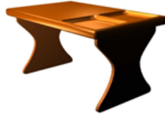
Figure 7. Selected table design.

From the calculation results of the evaluation matrix, it can be concluded that the most desirable design is design A, namely the design of a laptop table equipped with a place for food and drink.