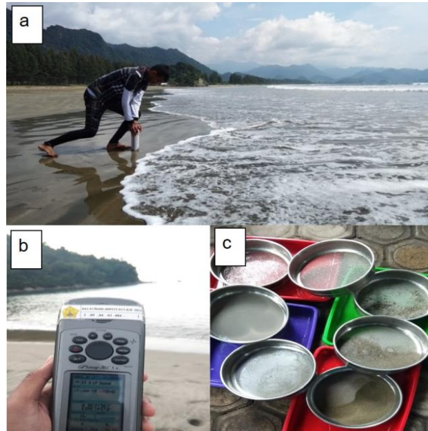
Figure 2. Field data collection process (a); GPS was used to obtain the precise coordinate (b); seven level of sediment sieves (c).