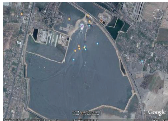
FIGURE 6. Photo of mudflow [7]

The water quality of Porong River which is located near the mudflow of Sidoarjo must also be maintained because the water is also used for the irrigation in Sidoarjo Regency. In fact, the irrigation water supply can also be taken from a reservoir of a dam. Dam construction is one of the best solutions to develop the potential of water resources given the current imbalance of water resources [3]. But the location of the district area Sidoarjo is landward and near the estuary of the river that is not enabled to build a dam. Under these conditions, it is necessary to make new innovations to utilize Sidoarjo mudflow as sand/rock substitute for mixed pairs of irrigation channel construction.