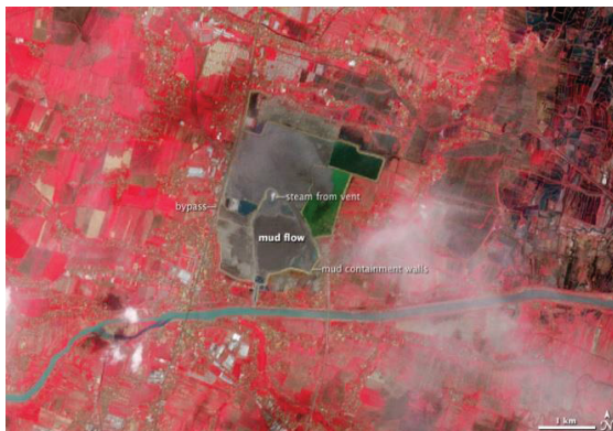
FIGURE 5. Photo of mudflow [7]