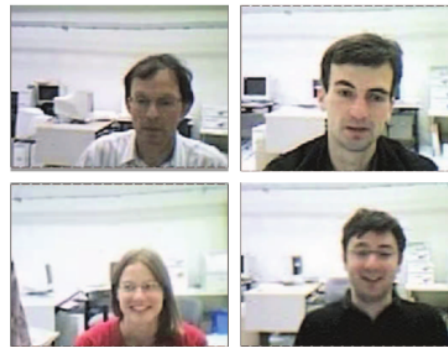
Fig. 2. Image samples of four video sets used in the experiments.

In the experiments, four methods are tested using the same hardware, i.e. the Raspberry Pi and camera module. Since only one camera module is employed, it is difficult to prepare the tested object (human) that is able to repeat the same movement for every method under testing. Instead, the recorded video is employed, in which it is played back to evaluate every method. Therefore the camera module is placed in front of the computer's monitor that playing the tested video. This arrangement ensures that every method captures the same video images. The tested video images are taken from NRC-IIT Facial Video Database [15]. Four video sets are used for evaluating the methods. The image samples of the four video sets are shown in Fig. 2.