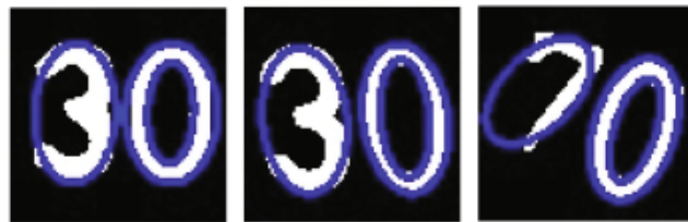
Fig. 3. The blobs and rotation angle

To find the rotation angle of the sign, first we find the contour of blobs which represents the boundary of blob. Then the ellipse fitting technique is applied to the contour. The rotation angle of the sign is obtained from the angle of detected ellipse. As illustrated in Fig. 3, the detected ellipse is drawn with the blue color. In the case of speed limit 30 km/h, the ellipses extracted from the number “3” and “0” have the same orientation. The orientation of both ellipses represents the rotation angle of the sign. However, for the speed limit 70 km/h, the ellipses extracted from the number “7” does not represent the rotation angle of the sign. Fortunately, the speed limit signs used in this work have the number “0” in the last digit. Thus we may use the last digit or the rightmost blob to find the rotation angle.