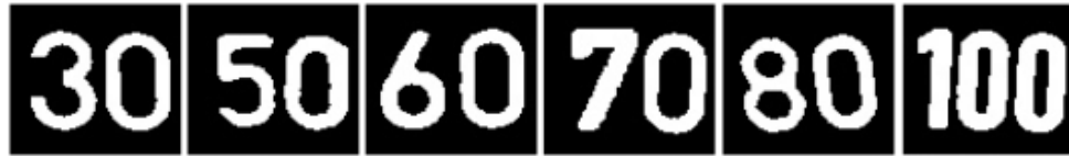
Fig. 4. Templates of digit numbers in the speed limit sign

Fig. 2(a), i.e. 80 \times 80 pixels. The templates used in this work are illustrated in Fig. 4. To match the blob with the template, the Euclidean distance is adopted.