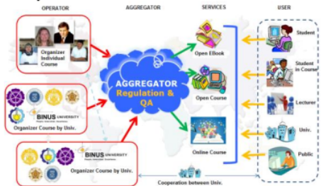
Figure 1. SPADA system [11]

SPADA Indonesia is developed to answer some challenges of higher education, like the limited capacity of the university, the low affordability of the university due to uneven distribution, some numbers of university that still do not have qualified education resources, qualified universities that still centered in Java island, the lack of quality and equal service in a university, and the lack of fulfillment guarantee of needs for quality university.