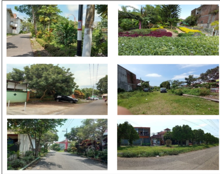
Figure 3. The condition of the open space

runs in balance. Some of the vacant land has been used by residents for farming, but these activities are not sustainable, so it needs a land management that involves various parties.