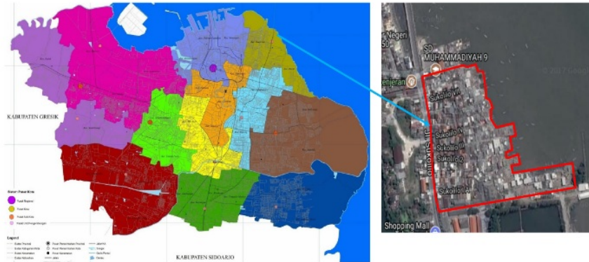
Figure 1. Coastal Area of Sukolilo, Bulak District, Surabaya

with 49% houses having incomplete assets due to the cost of usage and maintenance, for instance, fuel for boats and motorcycle, electricity for TV or radio, and credits for cellphone [2].