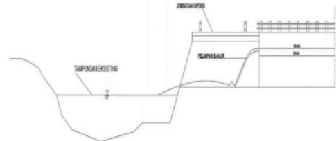
Figure 2. Concept of water distribution system

Based on the calculation, the flood plan discharge that will be used to be accommodated as a source of raw water is taken at the time of 2.5, and 10 years. Based on the results of calculations, floods obtained at flood waters and at normal water levels are as high as the Samiran Dam lighthouse. After that, the potential for taking is based on flood level and normal water level (see figure 2).