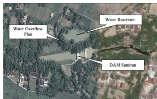
Figure 1. The site of flood control dam

Efforts to meet the need for clean water for residents of the City of Sampang must be accompanied by a policy to increase the capacity of the water supply system from the PDAM. Efforts to increase the supply capacity of raw water sources by utilizing the potential of Samiran flood dam water require in-depth analysis, especially related to the available dam storage capacity. However, the first step that must be done is to do a water quality analysis. Water quality analysis is very important to be done to ensure that river water used as raw water has a standard quality that is not polluted. This is important to ensure the safety of the community in using water, ie there are no adverse impacts on health. One study on water quality that can be used as an illustration is Sheftiana et al. (2017) who conducted research on the Gelis River in Kudus Regency, Central Java. The results of his research showed that river water quality was included in the medium polluted category. This condition is certainly not expected to occur in Samiran river water, considering that Sampang Regency is in dire need of river water as raw water for various purposes.