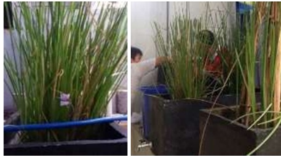
Figure 2. Constructed wetland with Vetiver grass ( Vetiveria zizanioides )

The application of the wetland system is very important to obtain processing results that meet the standard of agricultural water. Wetlands are made on a lab scale by utilizing aquatic plants as blackwater waste remediation agents. The type of plant used is Vetiver Root ( Vetiveria zizanioides ). This method is expected to be able to maximize the process of backwater waste treatment after going through the screening process with stratified filters.