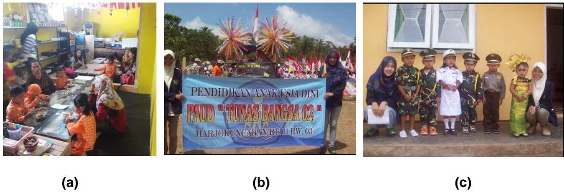
Figure 3. PAUD Tunas Bangsa 02 Social Characteristic

As with previous studies, this initial survey found various data analyzes related to social characteristics, including: