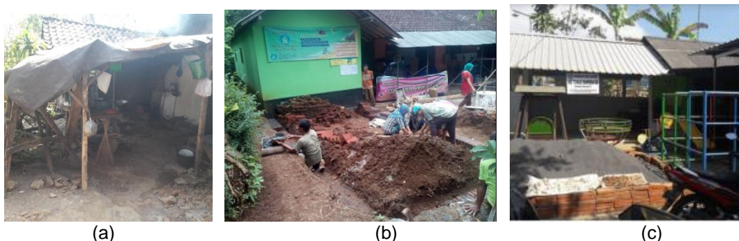
Figure 2. Spatial Physical Characteristics of PAUD Tunas Bangsa 02

From these preliminary observations, researchers in this initial study can take various points of observation related to spatial physical characteristics, among others, include: