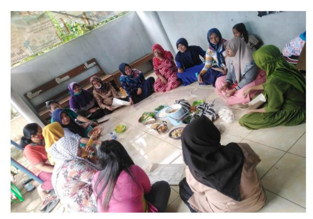
Figure 2. Initial discussion of the teachers, representatives of parents, foundations, and donors as the manipulative and theraphy process

The manipulative process is a participatory stage involving researchers and policy makers, namely: researchers, PAUD Tunas Bangsa, PAUD Foundation. It is called a manipulative participation process because of the manipulation process due to the direct non-involvement between the object of service and the researcher. In this process the involvement of the stamped committee is stakeholders and researchers.