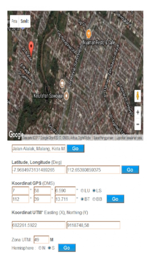
Fig 2. The Alternative Warehouse Locations

In Figure 1, the 4th iteration shows the results of the coordinates that are close to the 3rd iteration, so that the iteration is stopped at the 4th iteration. The x and y coordinate points at the 4th iteration are the final results of this calculation and the location points selected as the new alternative locations, which can be seen in Figure 2. The selected location is on Alalak Street, Malang City, located not far from the highway; thus, it is easy to access.